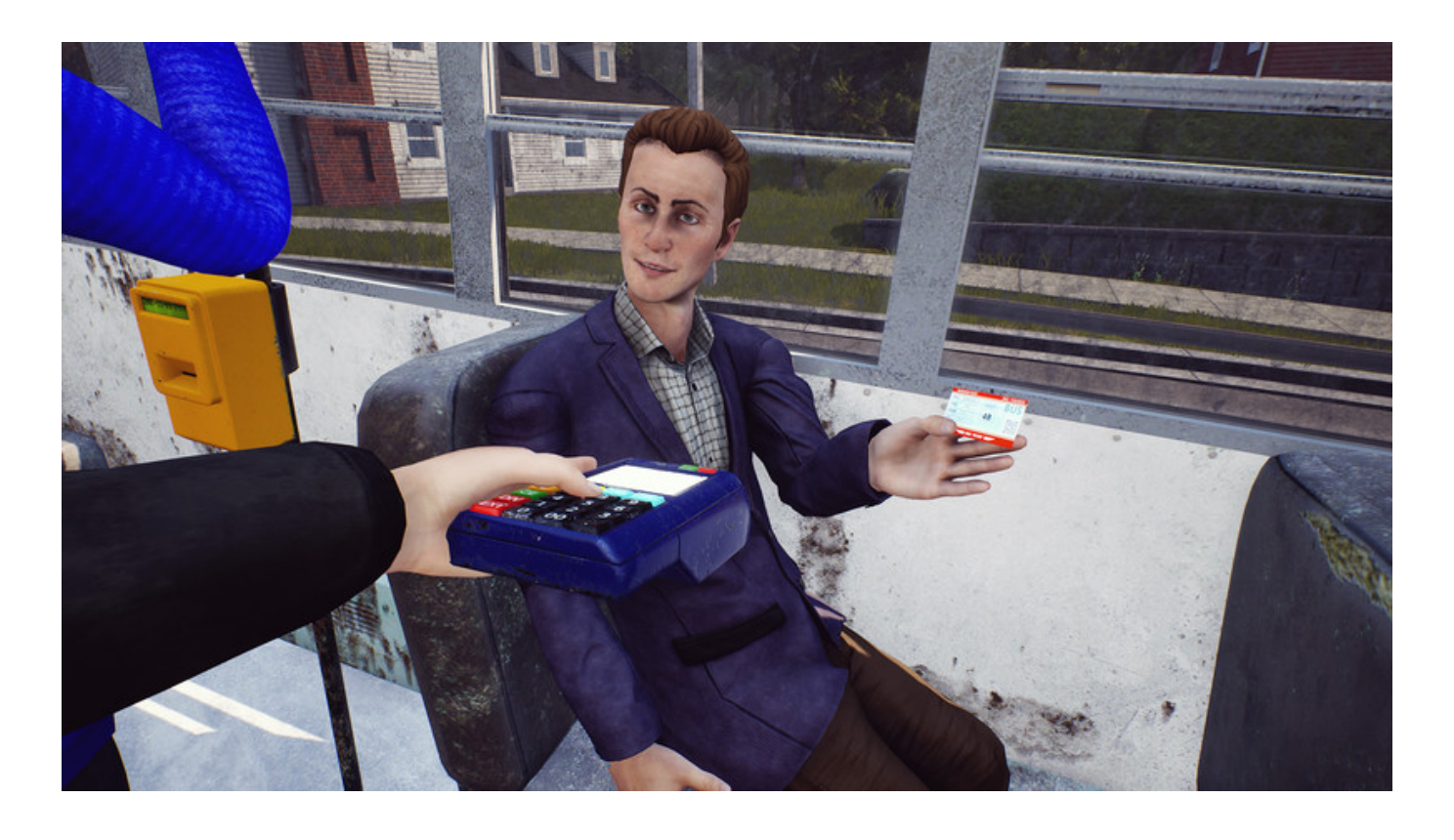
Download ->->-> http://bit.lv/2JXCba9