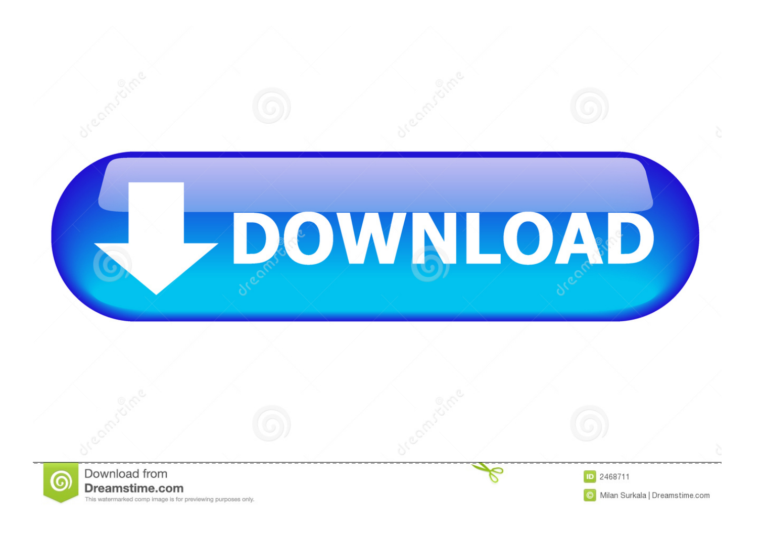
Ansys 12.1 64 Bit Download